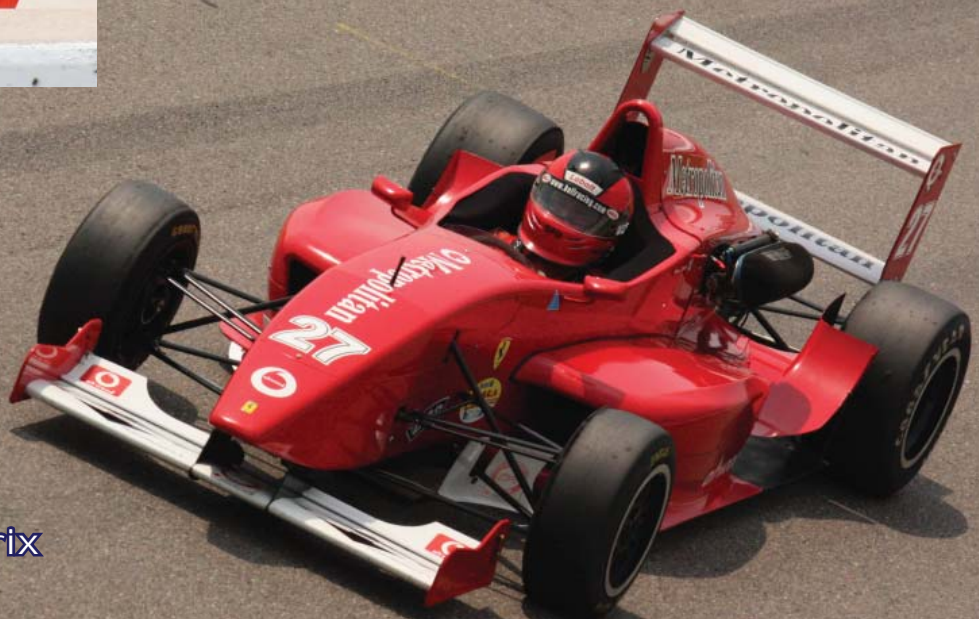
Canada Day Grand Prix