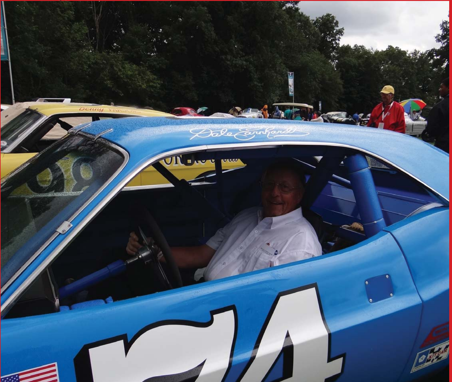
Trying out Dale Earnhardt's Dodge